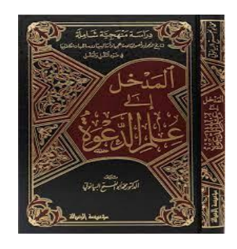
Figure 1. Old reference books of da'wah studies

These two books (figure 1) are traditional Islamic da'wah books which are widely used in Islamic universities and are recognized by the Islamic community. Both of them colored the thoughts of Muslims in the field of da'wah. Both contain an explanation of some of the fundamental elements of da'wah. Their existence is more accepted and authoritative when da'wah scholars lately refer to both of them in writing da'wah books.