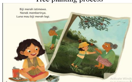
Figure 2. Tree planting process

When Grandmother gave her the tree seeds, Luna was very happy. This is shown by Luna's enthusiasm which is very happy. Grandma also stimulated Luna's desire by telling Luna that red seeds are very special, if Luna plants red seeds it will produce a lot of red seeds. After grandma gave the tree seeds then grandma told luna to plant the tree seeds. These findings can be seen in the following picture.